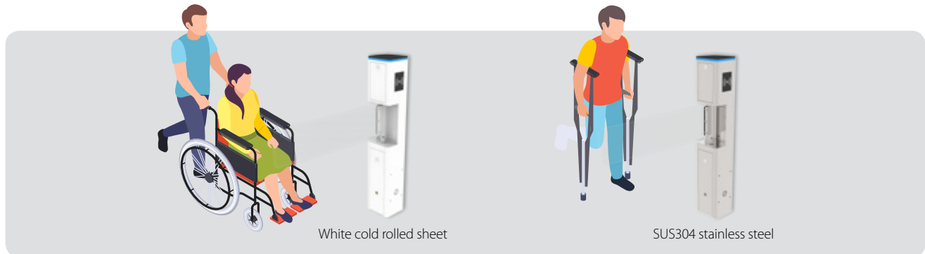
White cold rolled sheet